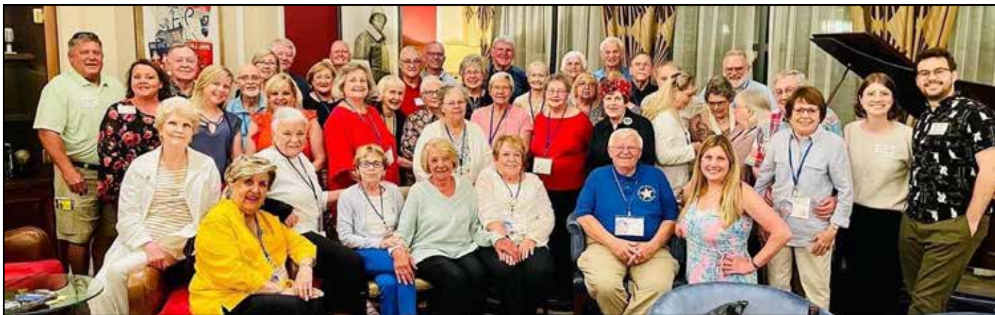
Above: The attendees of the 2022 "Honor and Remember" Conference having the time of their lives!