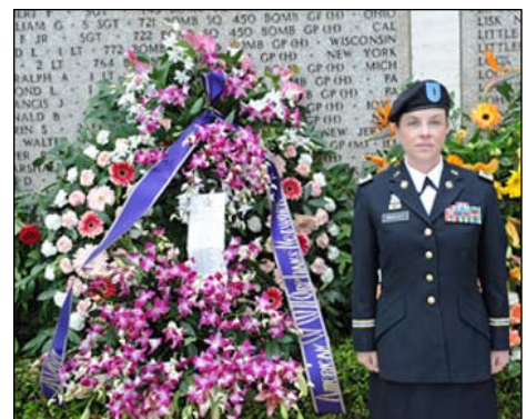
Florence American Cemetery and Memorial, Italy