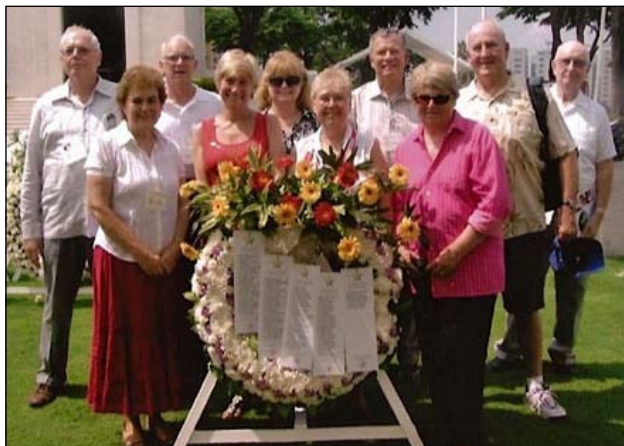
Manila American Cemetery and Memorial, Philippines