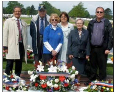
Normandy American Cemetery and Memorial, France