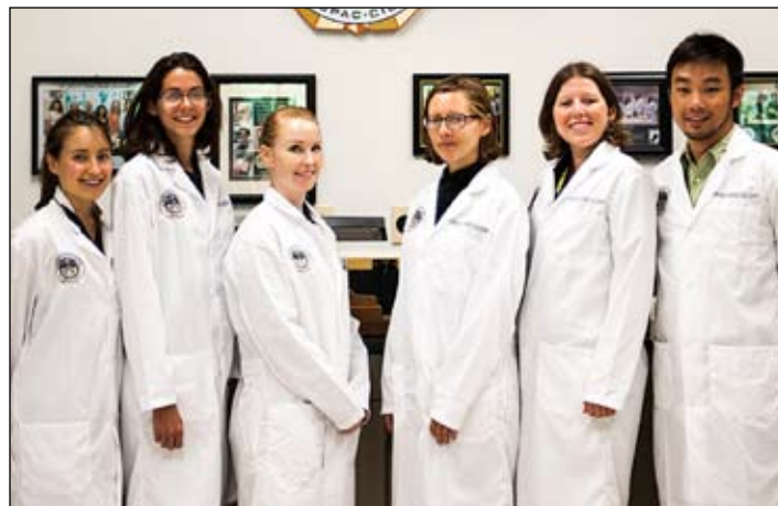
2014 FSA Fellows

The four-month curriculum focuses on a variety of topics in anthropology related to forensic science. Participants in the FSA develop or enhance their skills in the recon-