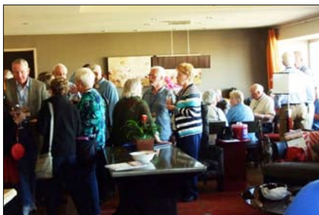
The Hospitality Room, and tour of the Museum of Flight