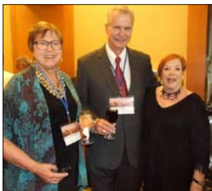
Mixing it up at the social hour before the banquet