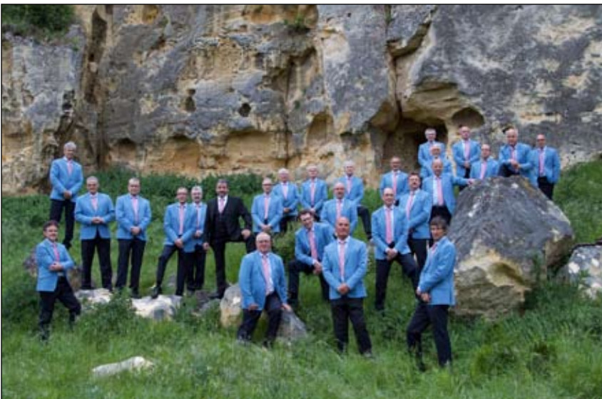
The Mergelland Men's Choir