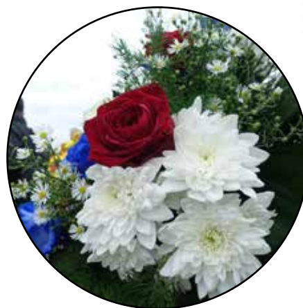
A lovely detail on the AWON wreath presented at Henri-Chappelle American Cemetery and Memorial.