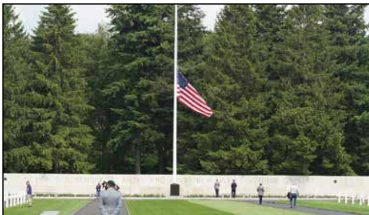
The flag flies at half-staff over Henri-Chappelle American Cemetery and Memorial, May 25, 2019.

Since 2003, AWON Members, family, and overseas friends have traveled the globe to attend Memorial Day ceremonies at the American cemeteries where our AWON fathers are buried or memorialized. They participate in the official programs, presenting a floral tribute along with other dignitaries. The AWON Memorial Day Wreath Project is possible through the generous support, time, and financial contributions of AWON wreath coordinators, AWON Overseas Friends, and member donations. Thank you for commemorating our fathers.