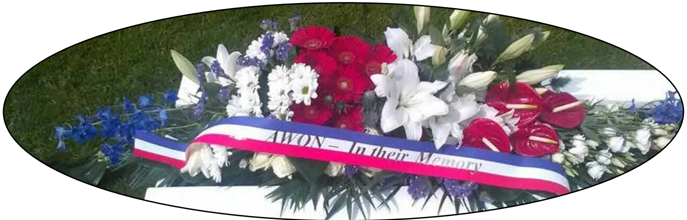
Above top left: The Memorial Day Ceremony at Ardennes American Cemetery and Memorial