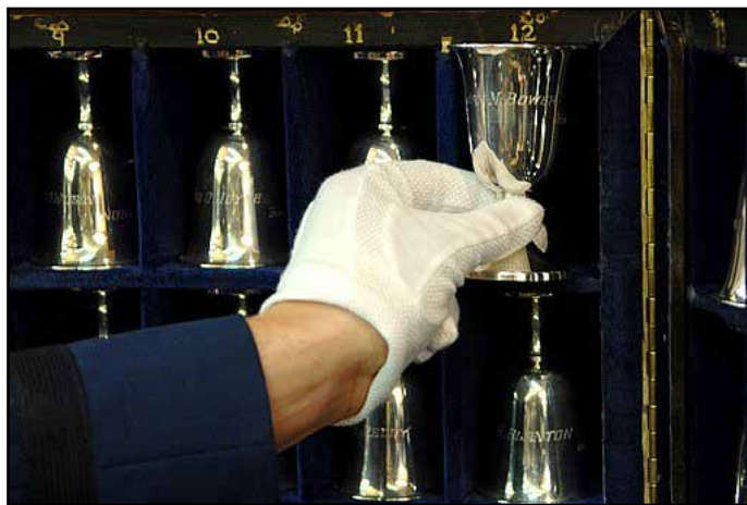
An Air Force cadet removes one of the Doolittle Raider goblets during a ceremony, 2005.